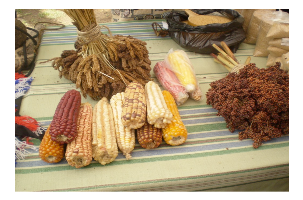
Figure 1. One of the key outcomes of IPC9 will be to develop strategies for promoting local seeds and traditional foods.

The venue for IPC9 is a large farm on the edge of the town with an African village and a lodge among other facilities. The IPC9 events will be centred on the village and more information about Kumbali is available on the web site <u>www.kumbali.com</u>. IPC9 takes place during the hot season just before the rainy season and so temperatures during the day in Lilongwe will range from 26 to 33 degrees centigrade with the nights being warm and temperatures falling to the lower twenties.