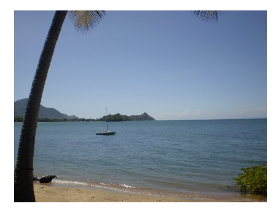
Figure 4. Lake Malawi – the lake of stars will be on the itinerary of the 4 nation post conference tour.

Pre-registration for the IPC9 events is now open online at the conference website <u>www.ipcon.org</u> and the forms and further information are also available from the conference secretariat at the following addresses: <u>zipscope@yahoo.co.uk</u>, <u>ipc9malawi@ymail.com</u>, <u>rescope@sdnp.org.mw</u>.