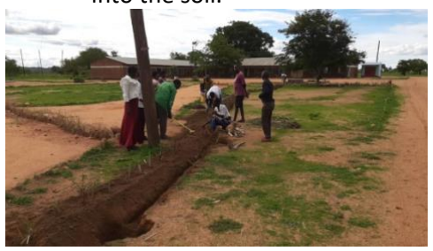
Teachers and Parents in Katete during ILUD training Dec 2019